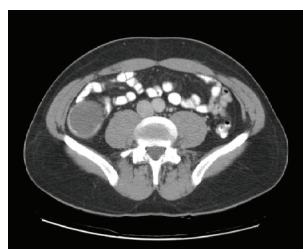
Figure 3: Normal blood flow in the hepatic artery and portal vein after insertion of the portal stent (3 years after stenting) and complete disappearance of ascites.