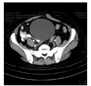
Figure 2: CT-scan: large tumor (rabdomyosarcoma) of the anterior abdominal wall, developed inside the abdomen.

The surgical procedure consisted of a wide resection of the tumor (Figure 5) and of the surrounding muscular layer. The complete resection of the rectus abdominis muscles under the umbilicus was necessary (Figure 6) in order to accomplish a tumor-free margin, which was stated by histological examination. The resection thus exceeded the macroscopic limits of the tumor by 4 to 5 cm. Abdominal wall reconstruction required a prosthetic mesh (Figure 7), which was easily covered by the cutaneous flaps and their subcutaneous adipose tissue. Histological examination identified a rabdomyosarcoma, with the same features as the previously resected tumors.