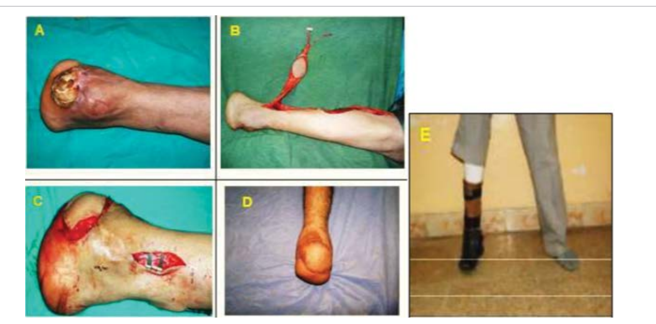
Figure 2: Case 1; 44 year old man, with history of previous war injury and Chopart's amputation of Rt. foot. He presented with chronic ulcer due to friction of amputation stump with fitted shoe (A-B): Raising of sural fasciocataneus flap. (C): Inset of flap in addition to supercharging technique to enhance lesser saphenous vein drainage. (D-E): Final result after more than one year.