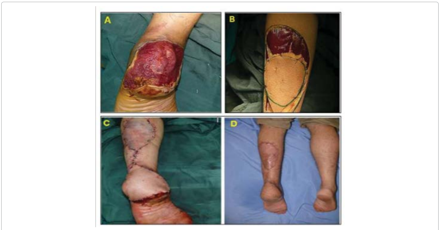
Figure 3: Case 4: 35 year old man, a victim of RTA with degloving injury to Lt. heel and medial malleolus (A-B): Raising of sural fasciocataneus flap. (C): Inset of flap. (D): Final result after 8 months, there is a mild hypertrophic scar in the donar site.