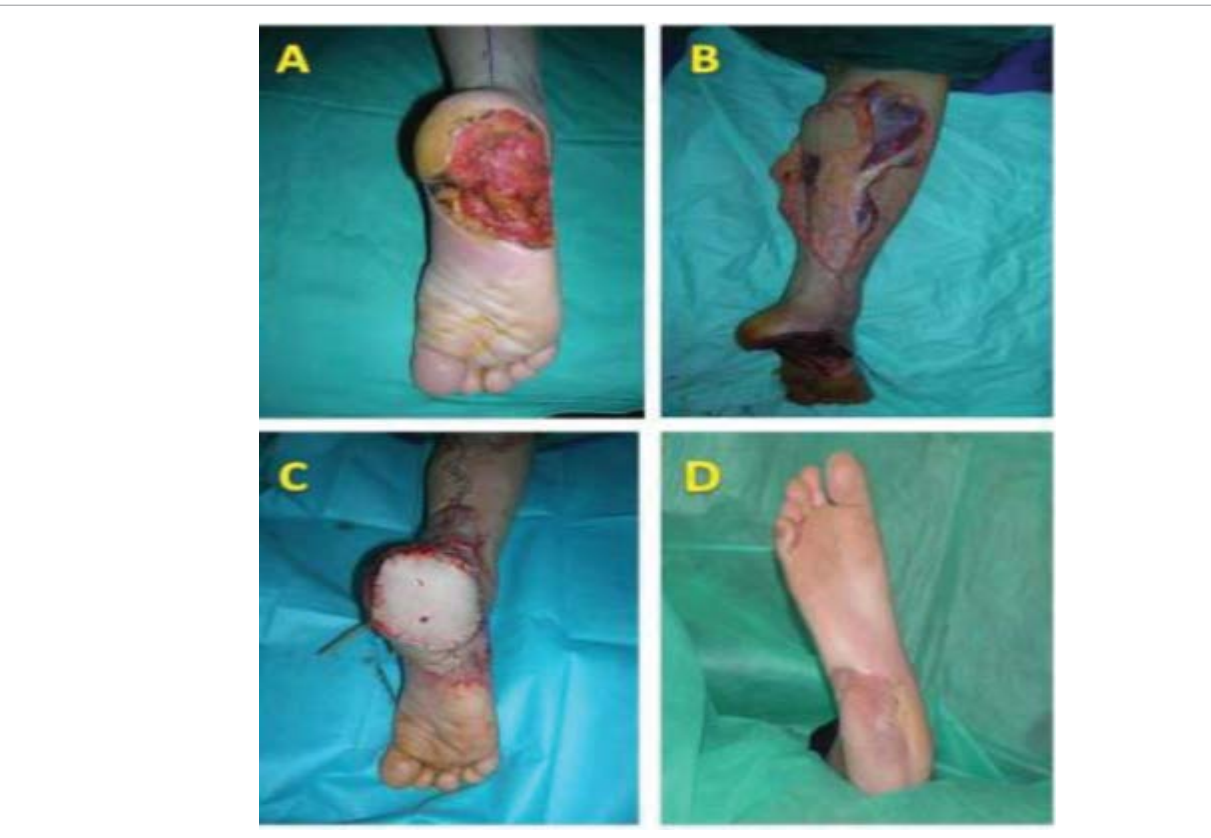
Figure 4: Case 7; a 27 year old woman, with diabetic foot ulcer involving heel and posterior plantar region (A-B): Raising of sural fasciocataneus flap. (C): Inset of flap with grafting of remaining part of plantar region which was not covered by the flap, by split thickness skin graft. (D): Final result after 1 year.