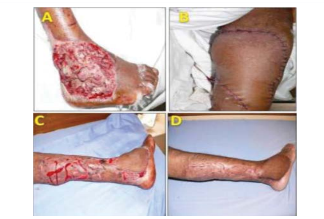
Figure 5: Case 9; a 30 year old man, a case of RTA with degloving injury to the ankle and lateral malleolus (A-B): Delay procedure of sural fasciocataneus flap had been done. (C): Flap after 2 weeks from it's transposition to the site of trauma. (D): Final result 6 months later.