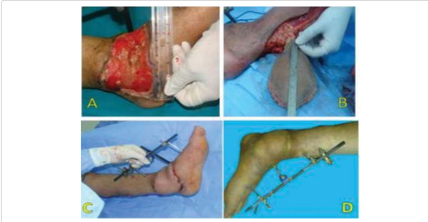
Figure 6: Case 16; 35 year old man, a case of blast injury with degloving of Lt. ankle and medial malleolus (A-B): Raising of sural fasciocataneus flap. (C): Inset of flap. (D): Final result after 4 months.

flap is the loss of sensibility along the lateral aspect of the foot but this deficit by itself rarely a complaint by these patients [10-12].