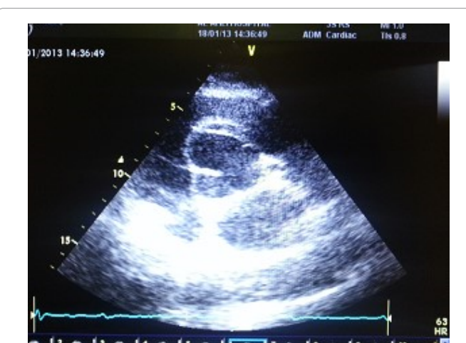
Figure 3: ECHO.

[1,2,16]. In one study the overall incidence rate of 10.4 per 100,000 person-years between 1980 and 1994 was more than threefold higher than the rate from 1951 to 1980 [1]. Once ruptured, emergent repair is extremely challenging with an associated mortality in the mid 90% range [1,4]. Overall survival for TAA has improved significantly in the past 15 years [2].