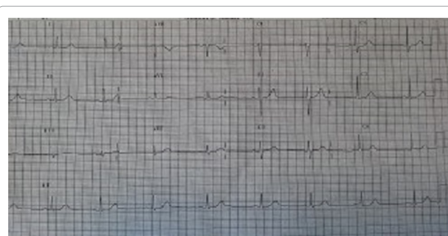
Figure 1: ECG.

The prevalence and incidence of thoracic aortic disease is increasing, as are the number of operations for thoracic aortic disease