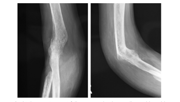
Figure 3: At the most recent follow-up evaluation, radiographic evidence of solid enlarged right elbow fusion could be observed.