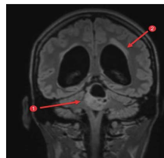
Figure 1: Preoperative T1-weighted coronal MR-image showing 1. Tumor with 4 e ventricle obstruction; 2. Enlarged lateral ventricles with transependymal CSF egress.

A MR-scan of the brain showed severe obstructive hydrocephalus caused by a fourth ventricular mass (Figure 1). At a gestational age of 23 weeks an endoscopic third ventriculocisternostomy was performed which led to rapid improvement. Surgical resection of the 4 th ventricular mass was performed at a gestational age of 25 weeks, as the required prone position would become increasingly difficult