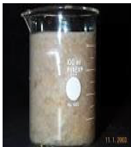
Figure 3: Chicken Eggshell powder mixed with Acrylic copolymer binder (Gel).