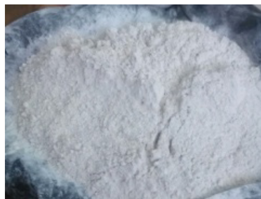
Figure 2: Manually grinded Chicken Eggshell fine powder.