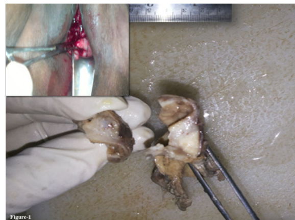
Figure1: Figure 1: Gross specimen showed grayish white illdefined tumor tissue, Per vaginam examination revealed an ulceroproliferative growth in the upper third of vagina on anterior and right lateral wall (Inset).

examination revealed an ulcero-proliferative growth of 2 x 2 cm in the upper third of vagina on its anterior and right lateral wall that bleeds on touch. Cervix was healthy and fornices were free (Figure 1a). USG revealed an atrophic uterus with normal endometrial thickness. VIA and colposcopy were normal. Cervical pap smear was reported as negative for intraepithelial lesion or malignancy. Following which incisional biopsy was performed.