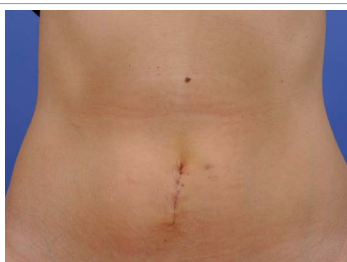
Figure 4: Initially simple closure.