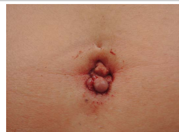
Figure 1: Umbilical endometriosis nodule.

Villar's nodule is rarely the first diagnosis evoked. In our patient,