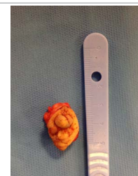
Figure 2: Excision of the nodule.