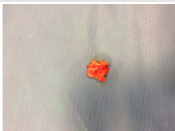
Figure 3: Excision was performed to the aponeurosis.