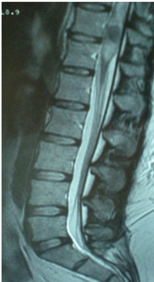
Figure 1: Preoperative magnetic resonance imaging (MRI), T1-weighted sagittal images showing an iso-hypointense lesion at level T11-12.

The gross appearance of melanocytoma is as a circumscribed, solitary, black or dark brown pigmented lesion, as seen in our case [4,6]. Although known as benign, the tumors can be aggressive, and malignant transformation has been reported [14]. Distinction between meningeal melanocytoma and malignant meningeal melanoma is not easy. Immunohistochemical staining may be helpful for distinguishing meningeal melanocytomas from pigmented meningiomas and schwannomas [4]. Goncalves et al. [3] described a case of spinal meningeal melanocytoma mimicking neurinoma. The potential for intracranial metastases of intramedullary tumors as described in the literature has not been shown yet for intramedullary melanocytomas [16,17].