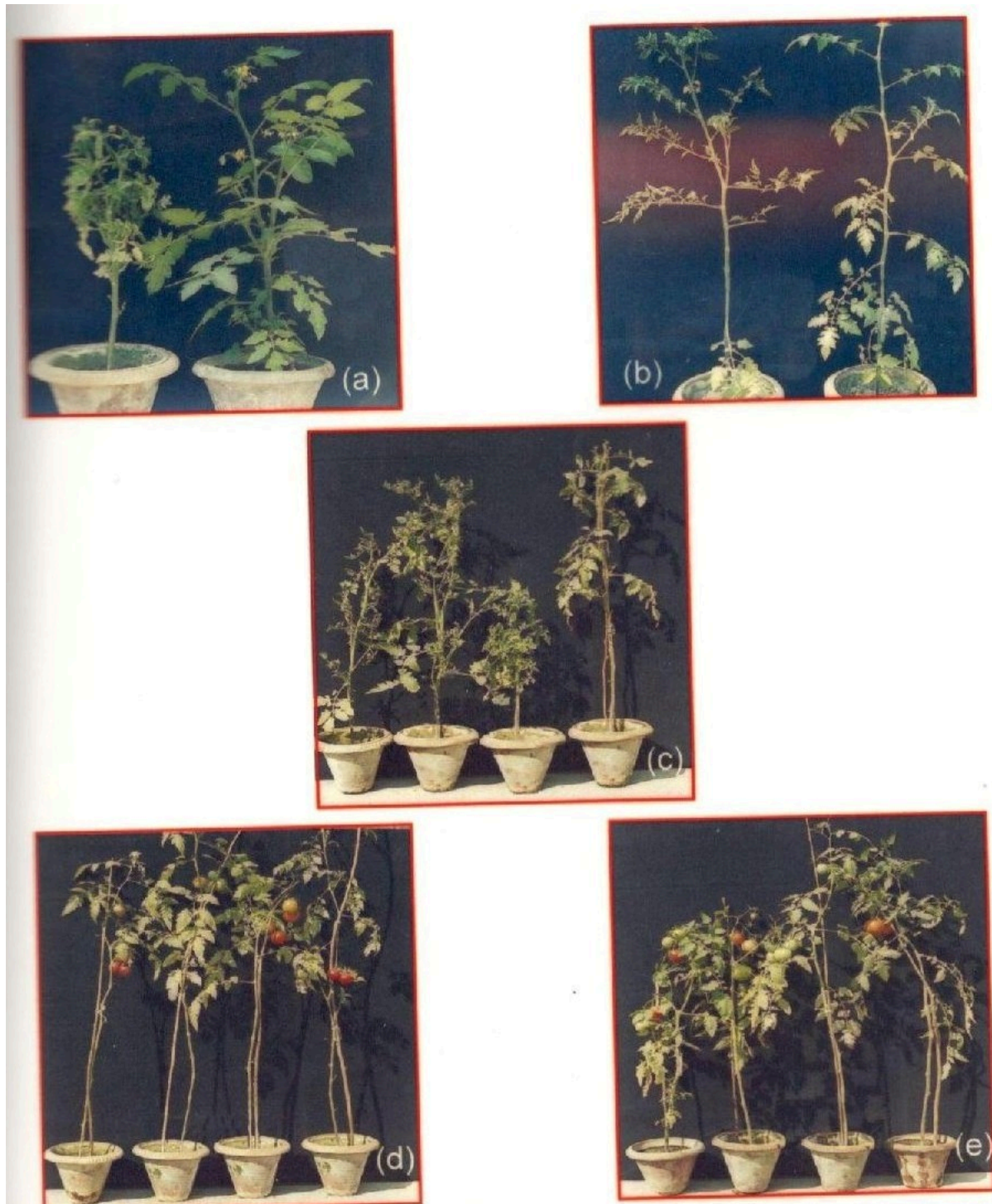
Figure 1: Effect of Clerodendrum aculeatum (CA)/ Boerhavia diffusa (BD) phytoprotein with bio enhancer M9/M3 (L-Lysine monohydro Chloride / L-Asparagine) on growth and disease incidence in Lycopersicon esculentum . (a) Untreated control plants showing viral disease symptoms (left) and healthy plants with CA+M9 treated (right) at early stages, (b) Untreated control plants showing viral disease symptoms (left) and healthy plants with BD+M3 (right) at early stages, (c) Untreated control plants showing high viral symptom at later stages, (d) CA +M9 treated plants showing better growth and high fruiting at later stage, (e) BD+M9 treated plants showing better growth and high fruiting at later stage.