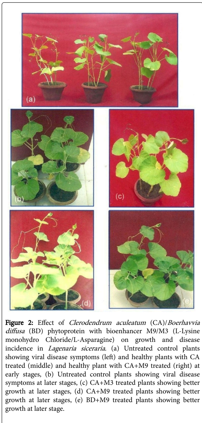
Figure 2: Effect of Clerodendrum aculeatum (CA)/ Boerhavia diffusa (BD) phytoprotein with bioenhancer M9/M3 (L-Lysine monohydro Chloride/L-Asparagine) on growth and disease incidence in Lagenaria siceraria . (a) Untreated control plants showing viral disease symptoms (left) and healthy plants with CA treated (middle) and healthy plant with CA+M9 treated (right) at early stages, (b) Untreated control plants showing viral disease symptoms at later stages, (c) CA+M3 treated plants showing better growth at later stages, (d) CA+M9 treated plants showing better growth at later stages, (e) BD+M9 treated plants showing better growth at later stage.

The phytoprotein from CA mixed together with M9 was more efficacious in protecting crops than CA alone. Enhanced flowering, fruiting, and crop yield was recorded in plants treated with CA phytoprotein only. Further increase in the above parameters was recorded with the use of modified CA phytoprotein. The addition of M9/M3 decreased disease severity and also the number of diseased plants (Figures 1, 2 and Graphs 1, 2).