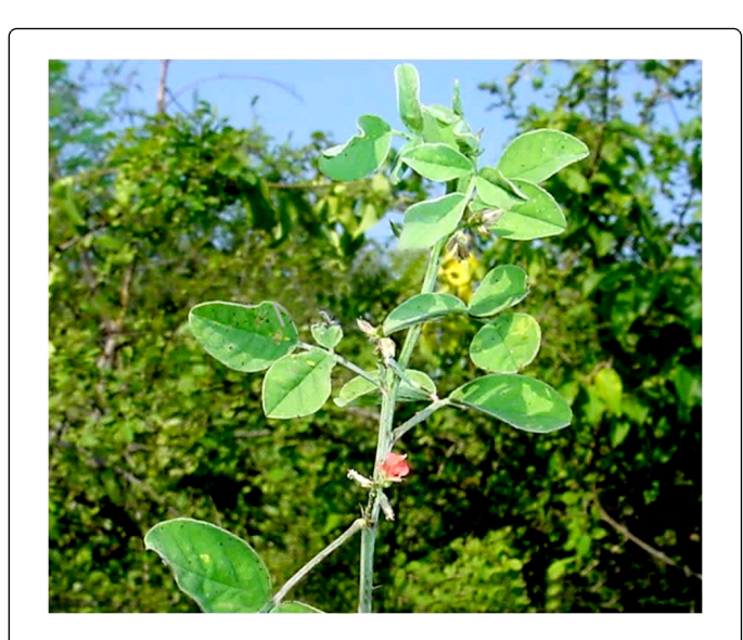
Figure 1: Photograph of Indigofera trita.

Indogofer trita is a dicot plant and phylum of tracheophyta. It is a class of magnoliopside and an order of fables, under a family of fabaceae. It is found throughout Africa, Asia and Australia widely distributed in South India of Tamil Nadu, Kerala, Karnataka. It has wide geographic and habitat range the population is inferred to be large and stable (Figure 1).