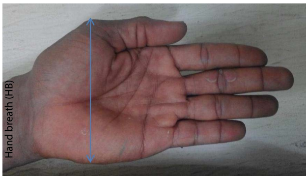
Figure 2: Shows the segmental landmarks for the Hand breadth (HB).

the proximal digital crease and the distal end of the third finger see Figure 1.