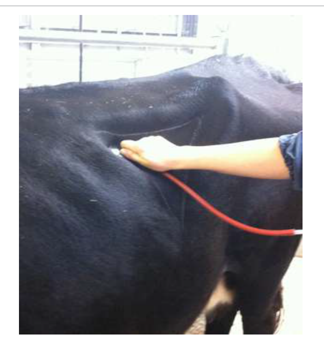
Figure 4: Auscultation of rumen contraction.