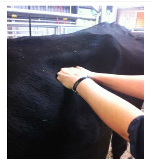
Figure 3: Feeling rumen contraction by palpation.

• Rectal examination of the internal abdominal structures: cut and smooth the nail; wear shoulder long glove; lubricate; cone shape of the fingers; insert in rotating way; notice: the hand cannot open, or even grasp organs inside. It's necessary or possible to use tranquilizer to reduce the sensitivity of the rectum in horse. In bloat case, the pressure in the abdomen would be very high, so it would be difficult to insert the hand inside (Figure 5).