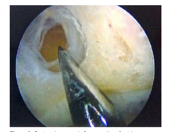
Figure 3: Cyst neck exposed after resection of ostrigonum.

In theatre a tourniquet was placed around the thigh. The patient was positioned in the recovery position with the affected side lowermost and the foot just off the end of the operating table. This position gives excellent access to the posterior ankle and is used by the senior author for posterior ankle arthroscopy as well as Achilles tendon surgery. The limb was exsanguinated and the tourniquet inflated. Two arthroscopy portals were made either side of the Achilles tendon, to access the ankle and subtalar joint, following the principles described van Dijk [5]. The retrocalcaneal fat pad was carefully incised to create a working space and the FHL tendon and the small ostrigonum were then identified as key landmarks. Cross sectional imaging had shown that the posterior talarintraosseous ganglion lay just deep to the small ostrigonum. The small ostrigonum was therefore resected, exposing the posterior ankle joint and the subtalar joint. The cyst revealed itself as a pinhole opening in the posterior talus (Figure 3) and the opening was dilated revealing a fibrous tissue membrane lining the cyst (Figure 4). This was easily and completely excised with arthroscopic curettes. Once the floor of the cyst had been exposed a 1.2 mm kirschner wire was used to create a series of holes into the cancellous bone beneath (Figure 5) in order to release osteoprogenitor cells into the cyst cavity. The cavity was then filled with