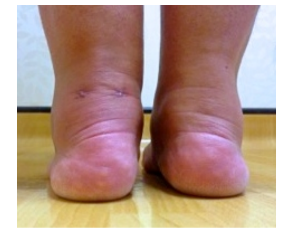
Figure 7: Hindfoot at 6 weeks post op (left side operated).

an injectable bone graft substitute (PRO-DENSE<sup>*</sup>, Wright Medical) (Figure 6). The portals were closed and the patient was immobilized in a back slab, non-weight bearing for 2 weeks. She then went into a boot, fully weight bearing for a further 2 weeks. By 6 weeks the patient was already making excellent progress, with good portal healing and only a small amount of residual swelling (Figure 7). She was able to stand on tiptoes without pain (Figure 8) and was able to walk 45 minutes without