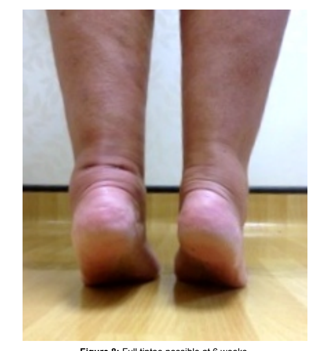
Figure 8: Full tiptoe possible at 6 weeks.

In 1972 Ogden and Griswold reported the first surgically managed case involving a unicameral bone cyst located in the anterior talar dome of a 15 year old [2]. This was successfully treated with curettage and autologous iliac crest bone grafting via an open antero-medial approach to the ankle. A year later Paaby reported two cases of talar intraosseous ganglions in adult patients, both successfully treated by open curettage and bone grafting with cancellous chips [3]. The first two cases of entirely arthroscopic treatment of a talar ganglion cyst were reported