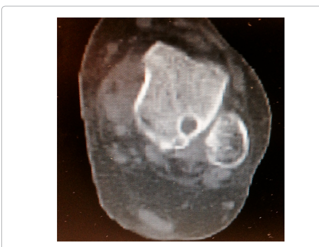
Figure 1: Axial CT showing cyst in posterior talar dome.

The gold standard surgical management of a talarintraosseous ganglion has been open debridement, curettage and bone grafting with good result [2-4]. More recently, arthroscopic treatment of a variety of ankle conditions has gained popularity and widespread acceptance due to the reduced morbidity and more rapid recovery associated with the technique. The method of hind foot arthroscopy popularized by van Dijk gives good access to the posterior talus and offers an attractive surgical approach to cysts of the posterior talus [5]. Three authors have so far reported their experience treating posterior talarintraosseous ganglions with posterior arthroscopy [6-8]. This is the first case report combining this technique with an injectable synthetic bone graft substitute containing a combination of calcium sulphate and calcium phosphate, designed specifically for the treatment of these types of defects.