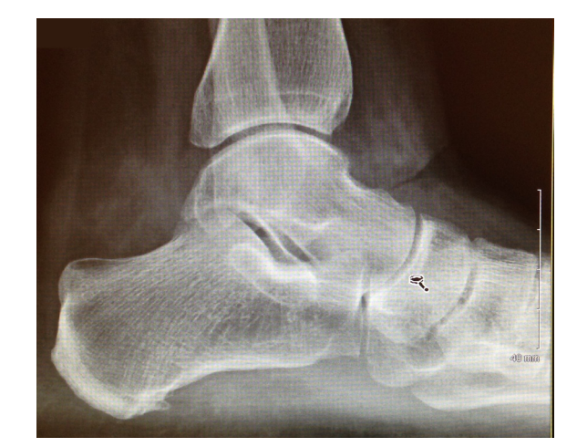
Figure 9: 8 week post-op X-ray showing some in-fill on the cyst.

by van Dijk's group in 2003 and both cases utilized posterior ankle arthroscopy to debride and graft the ganglion cysts [8]. Subsequently two other authors have reported the technique. In 2011 Ogut et al. reported a small case series of 6 ankles in 5 patients, where posterior ankle arthroscopy was used to access and treat the posteriorly located talar cyst in a minimally invasive manner [7]. In these cases autologous bone was used to graft the defects in five ankles and hydroxyapatite in one. Good results were reported. In 2014 Dawe reported a single case study of posterior talar cyst treated with posterior ankle arthroscopy and injection of demineralized bone allograft in a gel, with good results at 3 years [6]. Due to the rarity of talarintraosseous ganglion cysts there are no studies in the literature comparing open versus arthroscopic methods of treatment or comparing the treatment methods of dealing with the cyst itself.