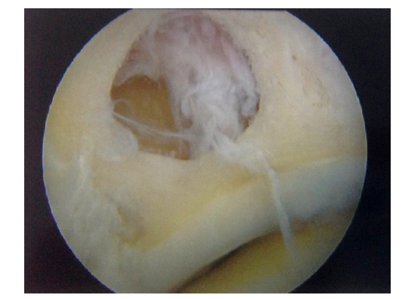
Figure 4: Fibrous tissue within the cyst.