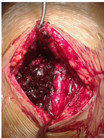
Picture 1: Surgeons performed an urgent re-laparotomy in third-post-operative day, who, despite good approximation, it revealed an haemoperitoneum.