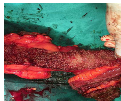
Figure 3: Polyposis lymphoid ileum and coeco-ascendentis.