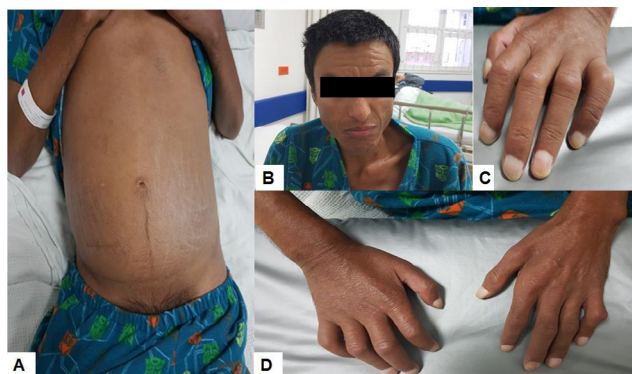
Figure 1: A. Ascites. B. Hyperpigmentation. C. Nail clubbing and leukonychia. D. Hyperkeratosis and sclerodermiform alterations.