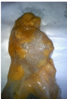
Figure 4: Pneumomediastinum in midline mediastinal soft tissues.

Furthermore the evidence of emphysema could be well appreciated during autopsy from the crackling sound under the dissection knife. The autopsy did not reveal any mucosal lesions of either the upper or lower airways. All the findings were noted and photographed in situ as well as after separating them from their anatomical attachments.