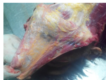
Figure 7: Air bubbles around mark of strangulation.

CSTE and pneumomediastinum was recorded in three control cases (10%); two cases of acute LVF and one case of hypertensive cerebral hemorrhage. However it was neither too gross nor present as a continuous stream. A patchy, irregular and focal distribution of separate tiny air bubbles was present at multiple foci in all three cases, which could be easily differentiated from continuous streaming emphysema found in hangings.