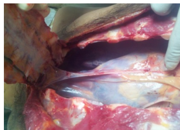
Figure 5: Dissection of the neck and chest.

Evidence of any cardiopulmonary pathology was ruled out from gross and microscopic histopathological examination. Layer-wise and careful dissection of the neck and chest did not reveal any evidence of pneumomediastinum (Figure 5), CSTE (Figure 6) or air bubbles around mark of strangulation (Figure 7).