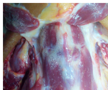
Figure 2: Air bubbles at the clavicles near the root of the neck and on the dorsal surface of upper layer strap muscles and ventral surface of deep strap muscles.

A further evaluation for the specific location of emphysema showed that CSTE and pneumomediastinum occur as coexistent findings, as none of the cases revealed these as independent findings which also suggest the presence of a pressure gradient between ruptured alveoli and the upper respiratory tract. A correlation of the phenomenon was made with Simon's bleeding (13/30 positive 43.3%) and clavicular periosteal hemorrhage (18/30 positive-60%) at the sternocleidomastoid muscle origin.