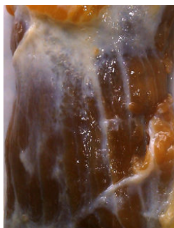
Figure 3: The dorsum aspect of sternocleidomastoid muscle.

In the neck muscles, the dorsum aspect of sternocleidomastoid muscle depicted this finding most frequently (Figure 3). Pneumomediastinum was prominent in midline mediastinal soft tissues (Figure 4).