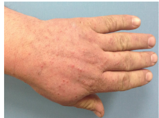
Figure 1b: Erythematous papules on hands.

No pathological finding was observed at general examination, and there was no fever. Dermatological examination revealed widespread erythematous crusted lesions, on the trunk and extremities, some of them were squamous and hemorrhagic (Figures 1a and 1b). There was no involvement on feet or hairy skin. There was no pathologic