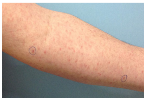
Figure 1a: Erythematous crusted lesions on extremities, some are hemorrhagic (in boxes).

Pityriasis lichenoides was first described by Neisser and Jadassohn. There are two separate clinical forms, PLEVA and PLC. The terms acute and chronic refer, not to duration of the disease, but to the characteristic features of the lesions [3,4]. The two clinical