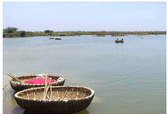
Figure 1: A view of Heggeri lake found in Haveri district, Karnataka State, India.

This lake is about 683 acres and a source of irrigation to about 600 acres of fertile land. In terms of its size, this lake is one of the biggest lakes in Karnataka. Recently the minor irrigation department as per government order (GO) MID/86/KGD2008 dated January 1, 2009 has transferred the lake to City Municipal Council Haveri for the supply of drinking water to the city during summer season (Figure 1).