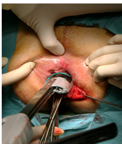
Figure 3: Resection; Resection of the prolapse continuously counterclockwise by the curved stapler and parallel to the dentate line, first anteriorly.