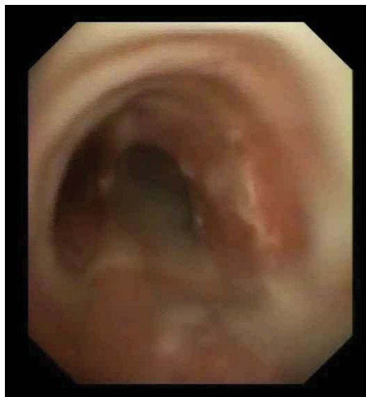
Figure 2: Bronchoscopic view.