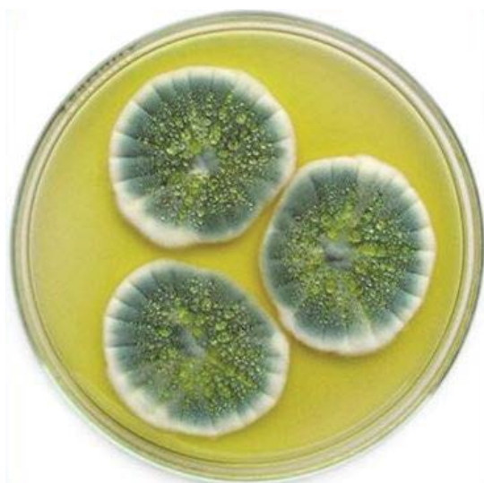
Figure 3: Macroscopic picture of Penicillium chrysogenum .

deteriorated and patient developed metabolic acidosis. Hence, he was put on haemodialysis for the indication of anuria. During dialysis five packs of packed red blood cells, three units of 100ml fresh frozen plasma and albumin were infused. Patient went into diuretic phase and most of the symptoms were resolved. After seven days of treatment, Hb was 10.4, 6100 cells/cumm TLC, 75% Neutrophils, 25% lymphocytes 25.0, 80 mg/dl S. urea and creatinine 3.0 mg/dl. Kidney biopsy was done later on to get the exact histology against various differential diagnosis in cancer patient. According to biopsy tubules showed patchy areas of acute tubular necrosis, RBCs and WBC casts were seen in some tubules. Tubular atrophy comprised about 15-20% of cortex. Interstitium showed mild edema. Mild diffuse interstitial inflammation were seen comprising chiefly of eosinophils, few lymphocytes and plasma cells. Arteries and arterioles did not show any significant diagnostic abnormality. Direct Immunofluorescence showed 3-4 glomeruli which