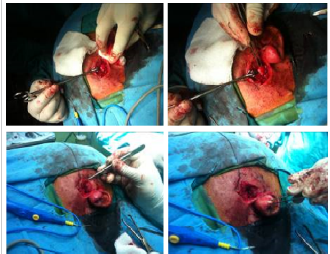
Figure 1: Parotidectomy: dissecting the skin and underlying layers.

The parotid gland is shaped like an upside-down triangle and lies in front and below the opening to the ear canal [9]. Anterior is the posterior surface of the jawbone and the masseter muscle. The deep surface of the gland lies alongside the back of the throat, near the tonsils. The gland is divided by the facial nerve into a superficial and deep lobe. The facial nerve arises in the skull, emerges at the stylomastoid foramen, enters the gland and branches out inside the parotid, defining the superficial