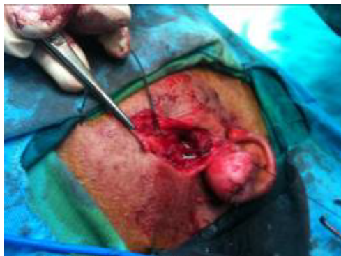
Figure 2: Exposure of the facial nerve.