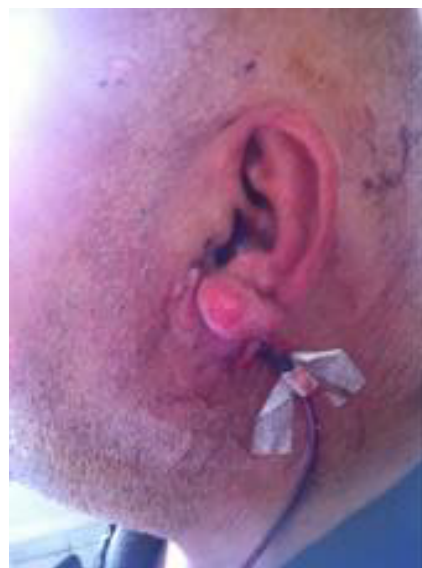
Figure 4: Final aspect; to note the vacuum drain to avoid hematoma.

and the deep lobe, and must always be identified and dissected when performing parotidectomy. It supplies the muscles of the face. Surgical landmarks to the facial nerve include the tympanomastoid suture line, the tragal pointer, and the posterior belly of the digastric muscle. The tympanomastoid suture line lies between the mastoid and tympanic segments of the temporal bone and is approximately 6-8 mm lateral to the stylomastoid foramen. The main trunk of the nerve can also be found midway between (10 mm posteroinferior to) the cartilaginous tragal pointer of the external auditory canal and the posterior belly of the digastric muscle.