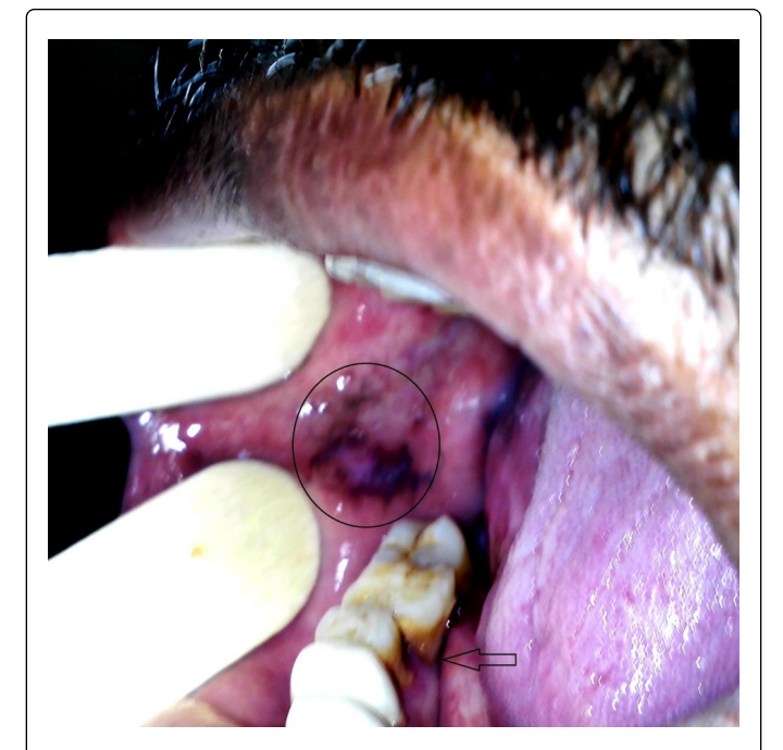
Figure 1: Oral mucosal pigmentation on the buccal mucosa of a 40 years old male. Chronic periodontitis is also evident (arrow).

dysplasia, G2^* Moderate dysplasia, G3^* severe dysplasia) [9]. No significant association (p>0.05) was seen with age, gender and the duration of ART with the frequency of oral lesions.