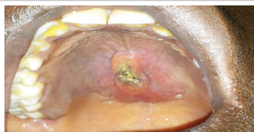
Figure 2: Mucoepidermoid carcinoma of the palate presenting as an ulcerated swelling on the midline of the palate.