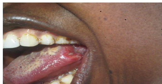
Figure 1: Squamous cell carcinoma of the tongue showing a large ulcer on the lateral border of the tongue.

Some studies in Nigeria have reported on the broad and specific histopathological types of orofacial malignancies [9,15,18,19,22,27,31].