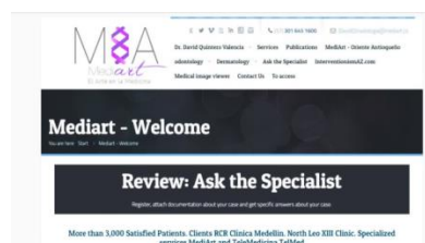
Figure 1: Image of the web portal.

questions and order behaviors (Figures 1, 2a and 2b) such as repetition in the case of an inconclusive biopsy, follow-up in case of benign or interconsultation by interdisciplinary group in case of malignant result. A simple easy to understand language is used and all patients doubts are solved and clarified.