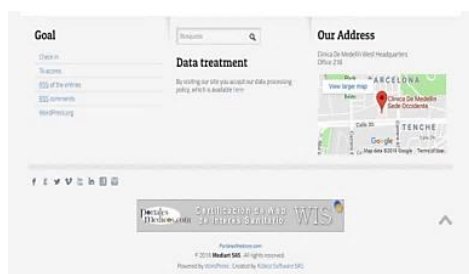
Figure 2a: Presentation of web portal.