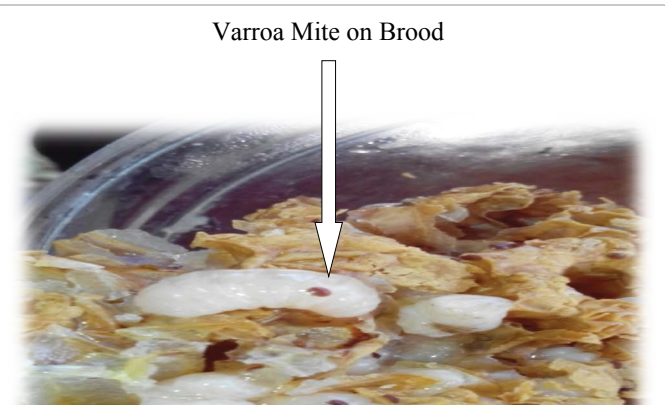
Figure 1: Brood infested with Varroa mite.

Table 2: Infestation rate at different peasant association.