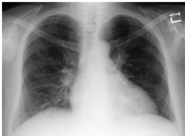
Figure 2: Chest X-Ray show improvement in pulmonary infiltrates after 6 weeks of treatment with steroids.