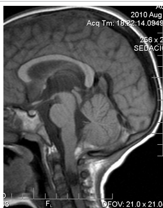
Figure 1: MRI revealing severe ischemic infarct in the cervical cord between C2 to C3.

During surgery we found: 1) leptomeningeal adhesions; 2) abundant fibrosis in the posterior surface of the spinal cord between C2 and C3; 3) small intramedullary cyst (about 5 mm of diameter ) in the left side of the cervical cord; 4) reduction of blood vessels, and 5) cervical cord was reduced to 70 percent and 3 cm of height. Previous end-to-end