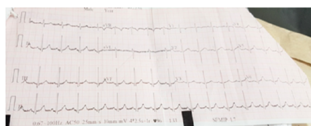
Figure 4: ECG of patient showing normal finding.

on Bain circuit. Then a vent mask was placed for oxygenation. In a few minutes her oxygen saturation started to fall. Her \text{SpO}_2 dipped from 100 to 17% and she became cyanosed. Immediately IPPV was given with bag and mask and her oxygen saturation returned to 100%. She was ventilated for some time and again a vent mask was put on. She