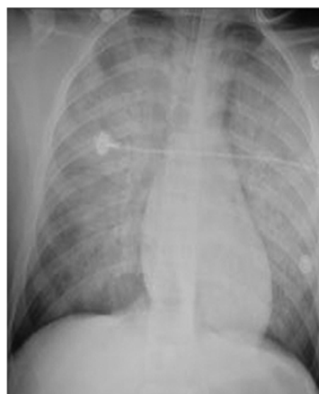
Figure 1: Chest X-ray (AP view) of patient: bilateral diffuse infiltrates.

Suddenly patient started to have convulsions. The patient was given inj thiopentone 50 mg and inj vecuroneum 1mg. The convulsions stopped. Loading dose of injection phenytoin 800 mg was given. The surgery was completed after another 40 min. Inj ondansetron 4 mg, inj