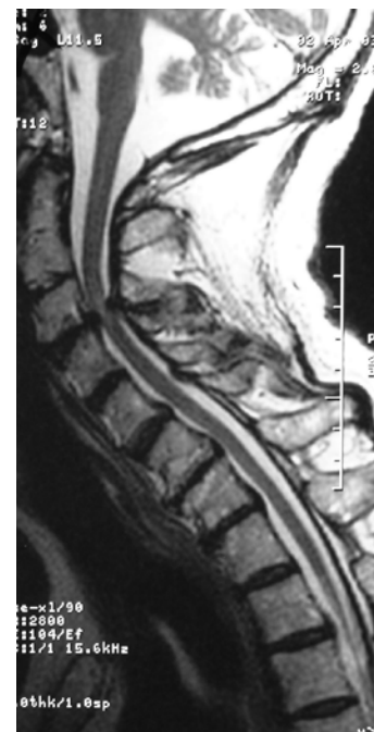
Figure 2: MRI of the spinal cord