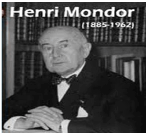
Figure 1: Henry Mondor.

Mondor's disease is thrombophlebitis of superficial veins or lymphatic vessels, mostly of the chest wall or breast, although it can involve other areas, such as the neck, abdomen and penis. In this review we concentrate on the diagnostic and therapeutic approach of only the chest wall, though much is common with presentation in other regions of the body. The condition was first described by Henry Mondor (Figure 1), a French surgeon in 1939 [it was first described by Faage in 1869 as a form of scleroderma] [1,2].