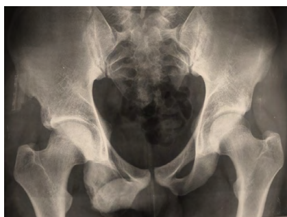
Figure 4: Three years postoperatively there was obvious radiologic evidence of callus formation.