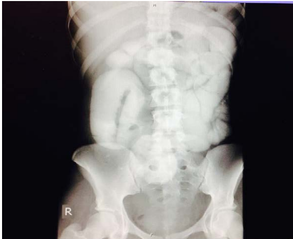
Figure 1: Supine abdominal X-ray with oral contrast. This X-ray illustrates, failure of progression of water-soluble contrast into the colon.