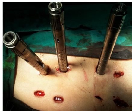
Figure 1: Tubes of the right side were removed with minimal skin incisions, while insertion tubes of the left side are still in position.

treatment of unstable spine injuries and spinal osteomyelitis [6]. Later, Mathews and Long [8] used a fully percutaneous endoscope-assisted screw system in 1995. They used a plate system instead of longitudinal