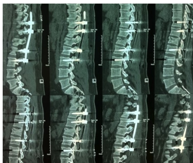
Figure 3: Sagittal 3D formatted computer tomography images show complete implant material with satisfactory correction of sagittal kypho/lordosis of the thoracolumbar region.