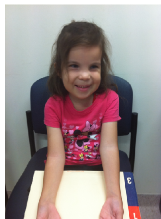
Figure 1: Demonstrating macrocephaly, broad nasal bridge, coarse features, and ocular hypertelorism.

She presented to a regional paediatric clinic at 18 months of age with concerns of speech and gross motor delay. At this stage investigations performed included karyotype, metabolic screen and thyroid function test all of which were normal. She was subsequently lost to follow-up, but represented at 7 years of age with learning difficulties, joint deformities and reduced mobility. She was noted to be <3rd centile for her height and on the 3rd centile for her weight at 107.6 cm and 17.4 kg respectively. She had short stature with macrocephaly but no obvious mesomelia. She had a broad nasal bridge, coarse features, ocular hypertelorism, lowset and posterior rotated ears (Figure 1).