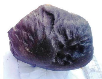
Figure 1: Photograph of Sadiya meteorite.

The electron microscopic study of the meteorite sample reveals olivine, pyroxene and trillite as major minerals (Figure 2). All unweathered ordinary chondrites show these four iron-bearing minerals. Therefore, the presence of these minerals in Sadiya meteorite confirms that the meteorite under consideration is an LL-type ordinary chondrite