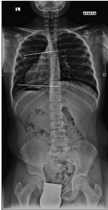
Figure 1: PA radiographs showed a slight scoliosis (Cobb angle: 20°) from the T4 level to the T10 level.