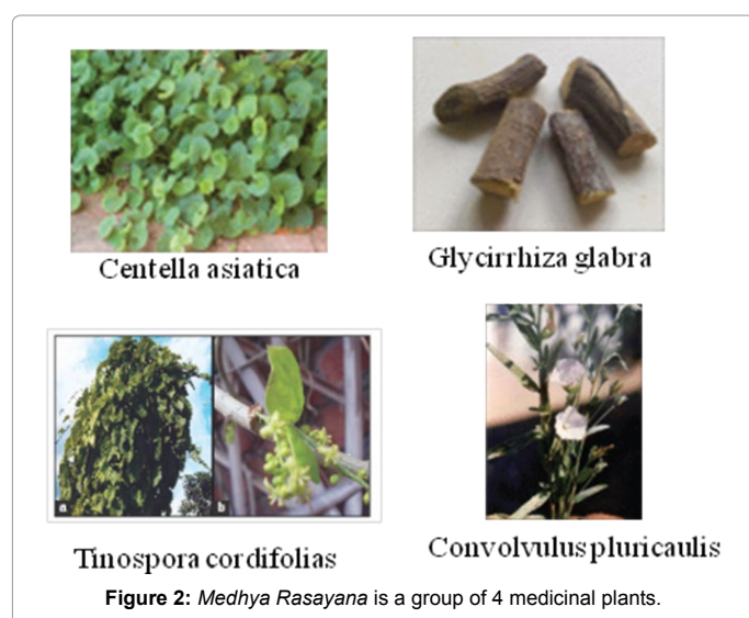
Figure 2: Medhya Rasayana is a group of 4 medicinal plants.