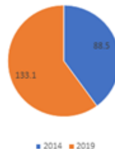
Light Weight Material Markets in Billion USD

Material Engineering with smart material marketplace is expected to garner $72.63 billion through 2022, registering a CAGR of 14.9% all through the forecast length 2016-2022. Smart substances are adaptive or shrewd Materials that pose intrinsic and extrinsic talents. Those may be altered by means of external stimuli, consisting of moisture, temperature, electromagnetic field, and strain to reap the preferred useful outcomes. Further, these materials are dynamic in nature and reply to their immediate interplay environments with the aid of adapting their traits. Improvements inside the materials technological know-how area resulted within the development of substances for specific programs. Medical material annual growth rate (CAGR) of 4.8% between 2015 and 2020. This report provides: An overview of the global markets for medical Material with detailed coverage of North American markets, and broad-based estimates European Country. The growing demand for smart materials in north America, Asia pacific, Europe and coupled with its increasing applications in the view generation and rising environmental concerns are expected to reach the smart materials. That numerous reports have been produced in recent years in Asia and world - wide, with the aim of drawing a comprehensive picture and proposing coordinated actions towards the establishment of coherent strategies in the field.