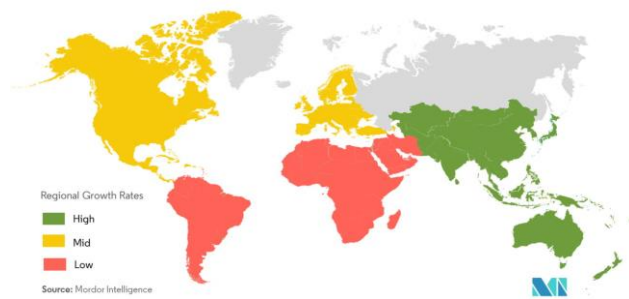
Cardiovascular devices Market - Growth Rate by Region (2018)