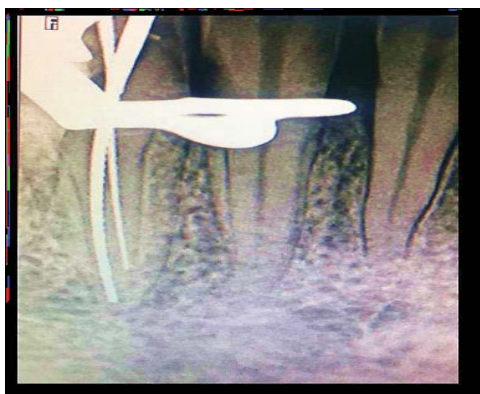
Figure 4: Working length measurement radiograph with two K-files in two separate roots.