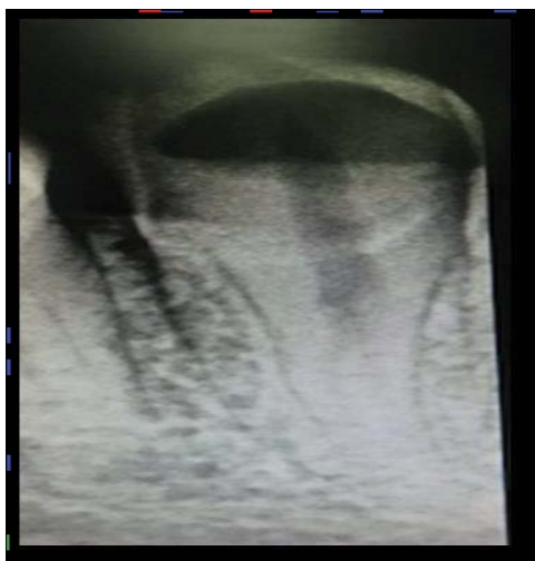
Figure 2: Preoperative radiograph of mandibular canine revealed two separated roots.

instrumentation in both canals up to #60 k file. Root canal irrigation was done using 5 ml of 3% NaOCl with each file use and final rinse using 5 ml of saline. After chemo-mechanical preparation, root canals were dried using sterile paper points, and then obturated with cold Lateral Condensation Filling Technique using gutta percha 2% (Dentsply-Maillefer, Ballaigues, Switzerland) and Seal Apex (Kerr Manufacturing Co) root canal sealer. Master gutta percha cone #40 in buccal canal, #35 in lingual canal were inserted into canals, tug back was confirmed and evaluated radiographically (Figure 5). Inserting sealer coated spreader size #25 (Mani Inc., Tochigi, Japan) next to the master cone, 1 mm shorter than the working length followed by insertion of accessory