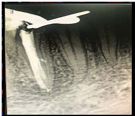
Figure 6: Obturation of both canals, lateral canals seal.