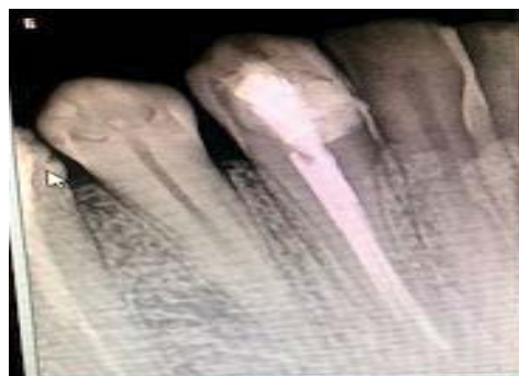
Figure 7: Root canals obturation and coronal restoration.