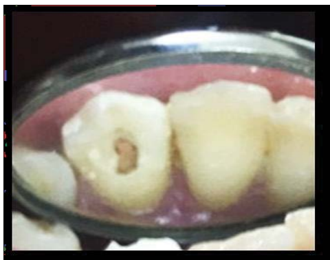
Figure 3: Access cavity showing separate orifices of two separate canals.