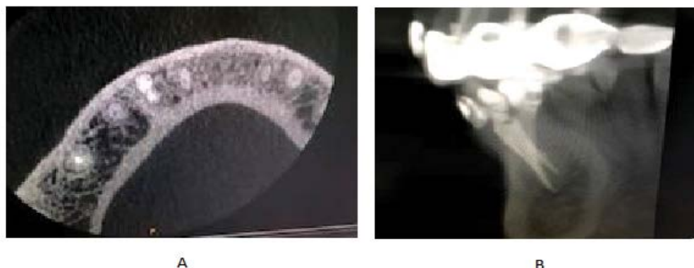
Figures 8: (A and B) CBCT images of the obturation of both root canals.

gutta-percha cones of respective size in the provided space by the spreader. This sequence was repeated till the spreader penetration was not more than 1-2 mm from the cemento-enamel junction. A plugger was heated and used to remove gutta-percha excess with no further vertical compaction. The access preparation was there after restored with glass ionomer cement, post-operative radiographic evaluation and CBCT (Cone Beam CT) of the obturation revealed proper length, density, and lateral canals seal (Figures 6 and 7). One week later, the patient clinical examination showed no symptoms and the tooth restored with composite resin final restoration (Figures 8A and 8B).