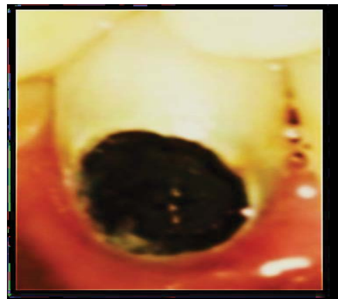
Figure 1: Photograph of mandibular canine showing deep caries in the Bucco-cervical region.

Clinical diagnosis showed symptomatic irreversible pulpitis with normal periapical tissues of left mandibular canine and the case was scheduled for nonsurgical root canal treatment of the involved tooth. After the local aesthetic administration (Lidocaine HCL 2% with Epinephrine 1:100,000) and under rubber dam isolation, caries was removed from buccal surface then sealed using glass ionomer cement (Fuji, GC, Tokyo, Japan) and the pulp chamber was accessed from lingual aspect using round and Endo-Z bur (Dentsply Maillefer, Switzerland) (Figure 3). To enhance the accessibility to the canals, the access opening was modified including more the lingual surface. Two main orifices were found: one lingual and one buccal. Canals were negotiated with #10 and #15 k files (Dentsply, Maillefer, Ballaigues, Switzerland).