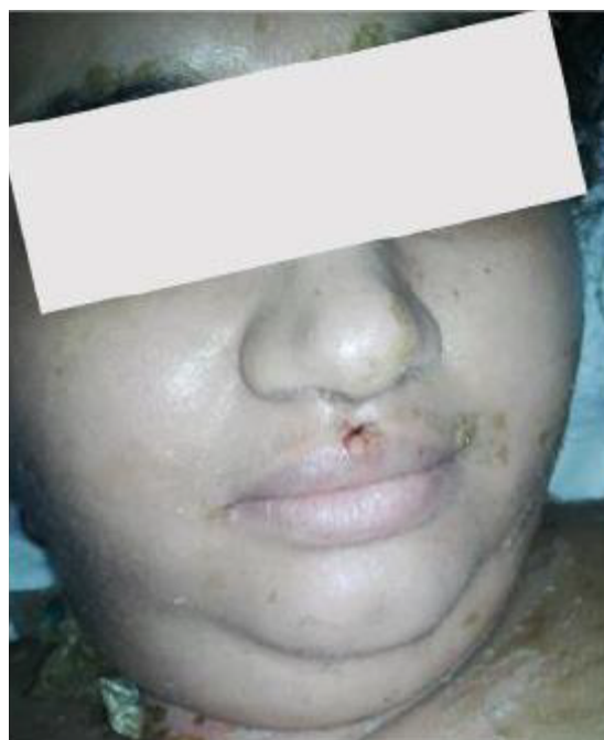
Figure 5: Healing lesions of the face.

Parenteral nutrition is often seen indicated the presence of lesions year the oral cavity, making any oral feeding difficult or impossible.