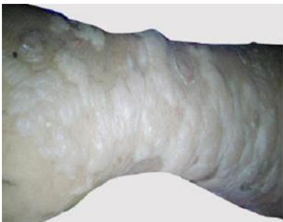
Figure 2: Bullous lesions (right forearm).