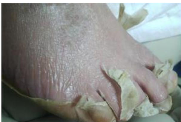
Figure 3: Epithelial regeneration and hyperpigmentation (Left foot).