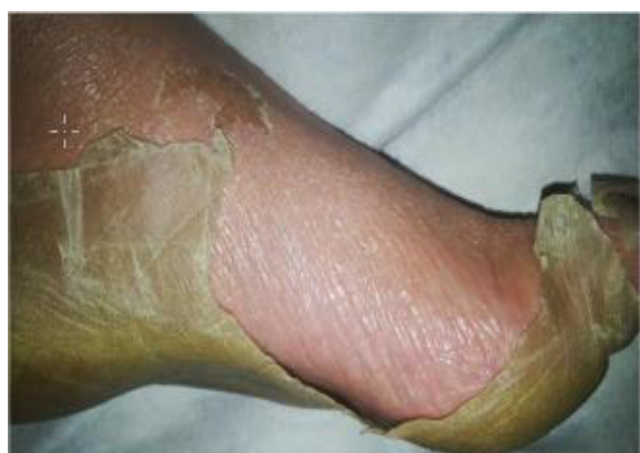
Figure 4: Epithelial regeneration and hyperpigmentation (Right foot).

series is 1 to 2 cases per million year [7]. This is a serious drug allergy, exceptional and unpredictable. It leads to destruction more or less extensive in the most superficial party of the skin. The mucous membranes of the mouth, eyes and genitalia are also affected. The disease extends for a few days (five on average). The severity depends largely