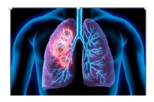
Figure 1. Patient with lung cancer.

This lung cancer is diagnosed by Imaging test, Sputum cytology, Tissue sample i.e. biopsy and then treatment is given like chemotherapy, radiation therapy, stereotactic body therapy, Immunotherapy, targeted drug therapy and, surgeries like wedge resection, segmental resection, lobectomy, pneumonectomy.