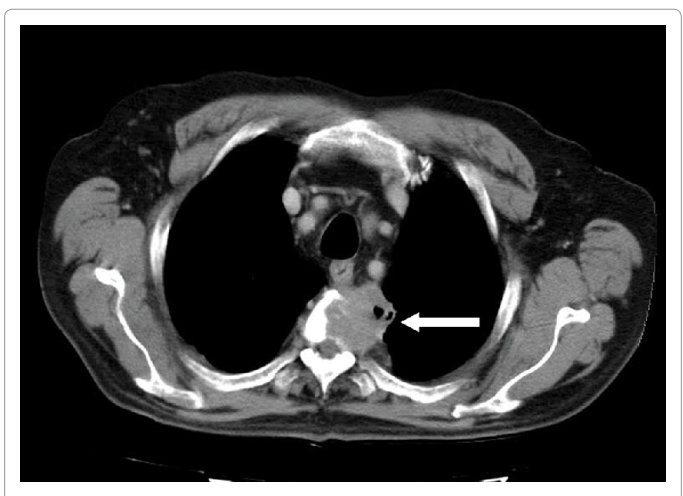
Figure 1: Scan of mediastinal window shows a malign mass lesion (white arrow) on posterior segment of the left lung upper lobe with invasion of corpus vertebrale (intermittent arrow).

undergone a laminectomy and posterior decompression operations on T2-T3-T4 vertebrae after having been diagnosed with stage IIIB lung cancer eight months prior (Figures 1 and 2). Since the diagnosis, he had been administered chemo radiotherapy and four cisplatin and gemcitabine chemotherapy treatments. It was learned that the patient, having received his last chemotherapy treatment three months ago. During his hospitalization, the patient had a fever of 39 °C, his blood pressure was 90/60 mmHg, while his pulse rate was 98/min in his physical examination. The other physical examination findings were normal except for a third-degree systolic ejection murmur in the mitral focus. In the laboratory analysis, the leukocyte was 6100/mm³, hemoglobin: 10.1 g/dL, thrombolytic: 127.000/mm³, glucose: 104 mg/dl, urea: 47 mg/dl, creatinine: 0.9 mg/dl, ALT: 23 IU/L, AST: 19