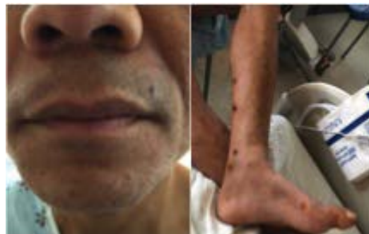
Figure 5: Improvement of skin lesions a week after treatment with penicillin.