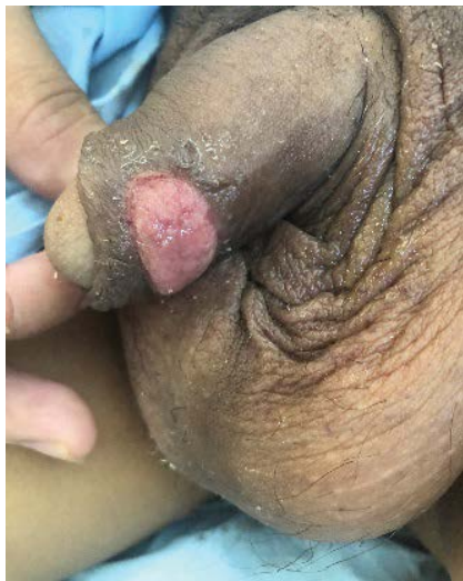
Figure 2: 3 × 2 cm painless, flat ulcer with a pink base over the left penile shaft.