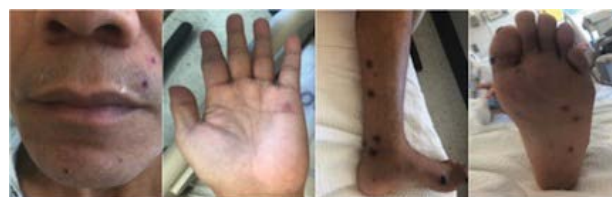
Figure 1: Scattered, papular lesions with central ulceration and overlaying eschar throughout the bilateral upper and lower extremities, face and body.

Laboratory studies showed a hemoglobin of 8.8 g/dL with mean corpuscular volume (MCV) of 75.9 fL, white blood count of 4.3 \times 10^9 cells/L (neutrophils 2.7 \times 10^9 cells/L, lymphocytes 1.1 \times 10^9 cells/L, monocytes 0.5 \times 10^9 cells/L), and platelets of 413 \times 10^9 cells/L. Chemistry panel and liver function tests were within normal limits.