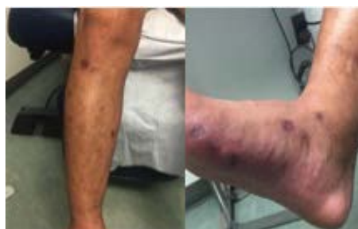
Figure 6: Healed skin lesions one and half months after treatment with penicillin.