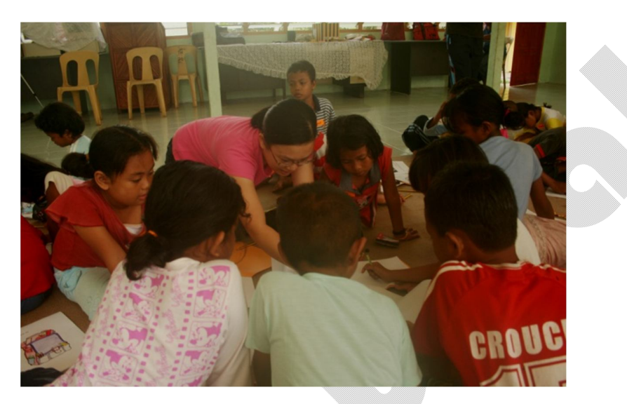
Figure 1: A student volunteer assisting the Living Literacies Programme.

familiar with mainstream educational practices, we consciously try to bridge the Orang Asli children's community experiences and knowledge with that of mainstream literacy that is expected in schools. For example, we encourage the children to speak in any of the languages they are comfortable with. The main language of instruction is Malay while all our printed literacy materials are in English language or bilingual (Malay and English). Whenever necessary we would ask the children to translate to their own Semai language. Furthermore, with the help of our secondary school assistants, we also translate and write in the Semai language.