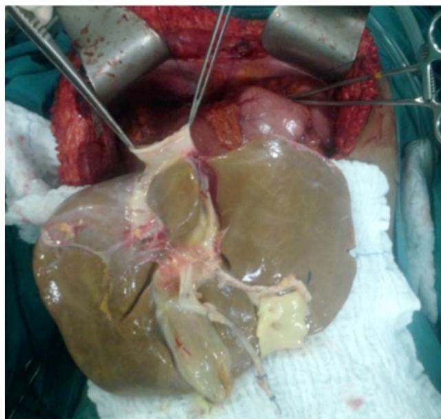
Figure 1: Graft in backward position.

For artery reconstruction we anastomosed the junction of the proper hepatic artery with gastro duodenal artery of the recipient with the junction of common hepatic artery and splenic artery of the liver graft with an interrupted 7-0 Prolene vascular suture. Biliary reconstruction was performed with end-to-end choledochocholedochostomy anastomosis without placing a T-type drainage tube with a running 5-0 PDS suture (Figure 2).