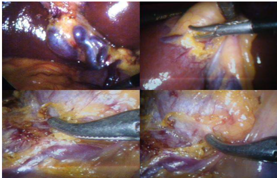
Figure 3: Intra-Operative Picture.

Harmonic energy source and taking very small bites of tissue at a time was helpful. Patient was discharged on first post-operative day. Although open cholecystectomy may assume to be safer in such patients; enhanced magnified vision, access and maneuverability made laparoscopy a preferred option.